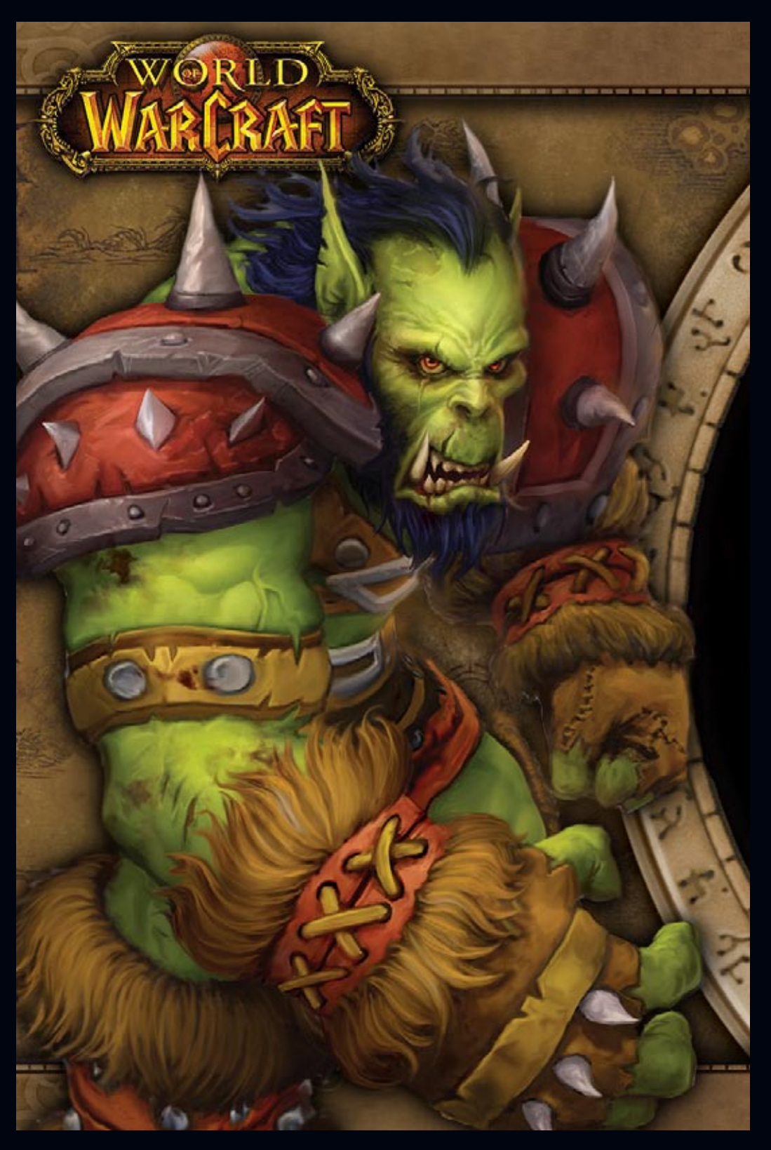
A typical Orc Warrior. The Orcs are one of the races that belong to The Horde.